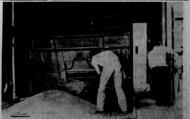
This photograph was made at the R. L. McClellan Grain Co. Inc. Grain Harvest is beginning to move into high gear.