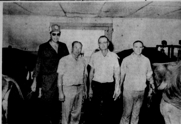
Ten area students have recently completed the four-day workshop on "Semen Handline and Artificial Breeding" sponsored by the animal science department at Panhandle State University and the American Breeders Service.

The course covered artificial breeding, collecting, processing and the storage of semen.