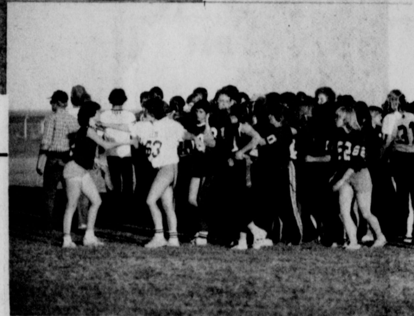
GRIDDY TEAM had the energy and spirit -- but missed a win Saturday night. Better luck next year, Griddies!