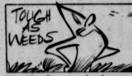
Weeds often survive because they can withstand extremes of heat and cold, drought, high winds - even fire.