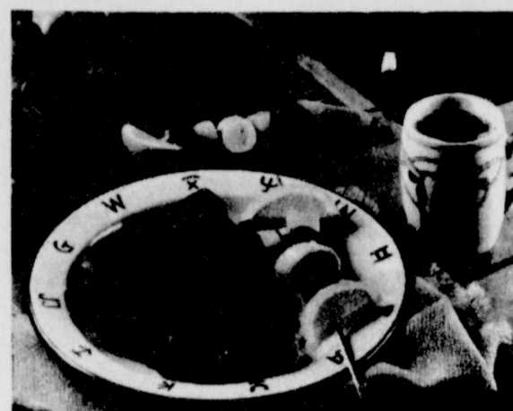
BEEF PORTERHOUSE STEAKS, broiled to perfection, make a Father's Day feast to be remembered.