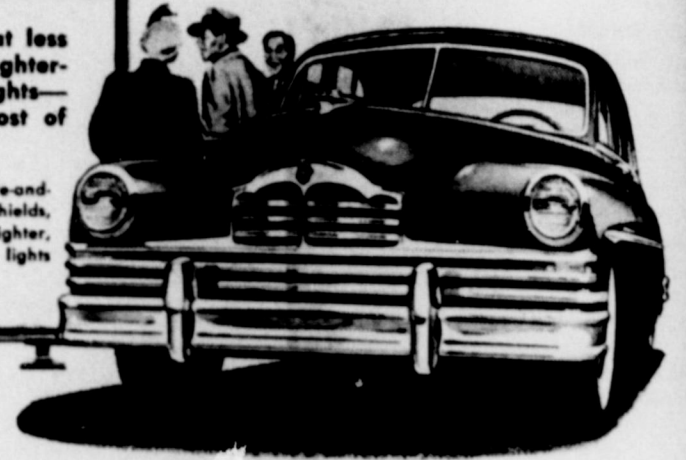
ASK THE MAN WHO OWNS ONE

Packard prices begin at less than the cost of many lighter-built, lower-powered sights—less, even, than the cost of some of today's sizes! And the price includes: Fore-and-aft direction signals, fender shields, electric clock and cigarette lighter, automatic trunk and courtesy lights . . . many other extras.