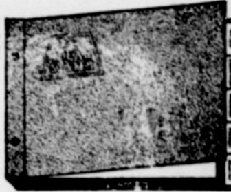
Actual Size 9 1/4 x 12 1/4 inches

A Simplified BOOKKEEPING and TAX RECORD All in One Loose-Leaf Book