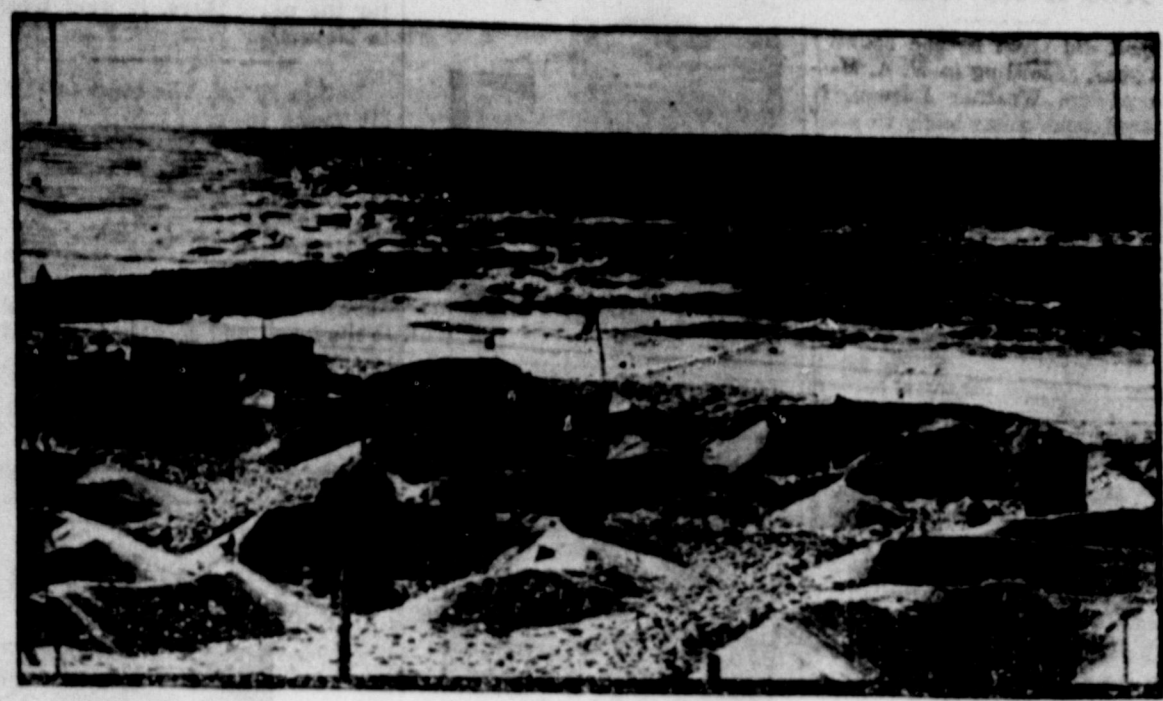
Island of Sylt in the North sea, where it is alleged Germany is constructing a powerful naval and airplane base, having enmoutlaged fortresses with five-foot thick walls and underground hangars for planes.