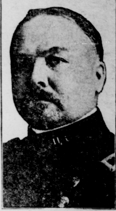
In charge of United States forces that are expected any day to begin march on