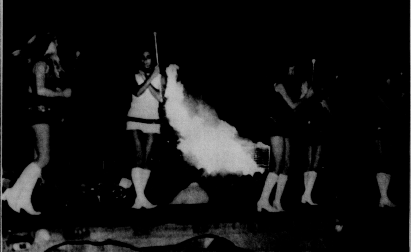
HIGHLIGHT OF HOMECOMING was the traditional snake dance and bonfire last Thursday night. Ozona High School majorettes and twirlers perform as the Spirit of Lion Country band backs them up. A large crowd of fans look on while the huge bonfire burns in the background in spite of a drizzling rain. Skies cleared the following night for the homecoming game and the Lions emerged victorious. A dance for ex-students Saturday night culminated the homecoming activities.

The Ozona Lions Club will sponsor a pancake supper Friday night before the Big Lake-Ozona football game. Pancakes will be served from 5 until 7:30 p.m. at the Civic Center. Tickets will be $1 and will be sold at the door. The Lions Club plans to make the pancake supper an annual event to raise money for their many civic and community projects through the year.