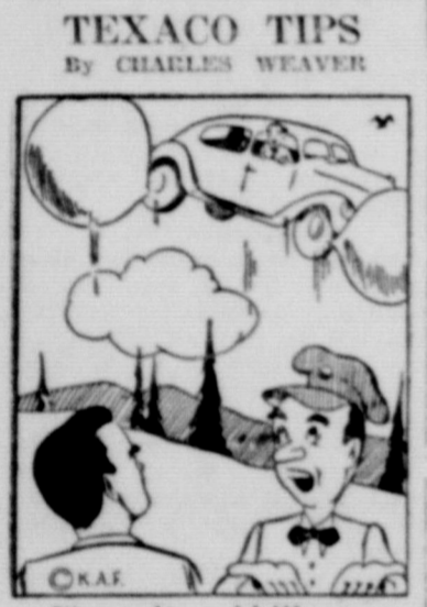
"Musta used too much bubble gum when I fixed the flats."

Mistakes can happen—but our SERVICE isn't one of them. We go out of our way to do the job quickly, dependably. For what your car needs—see us.