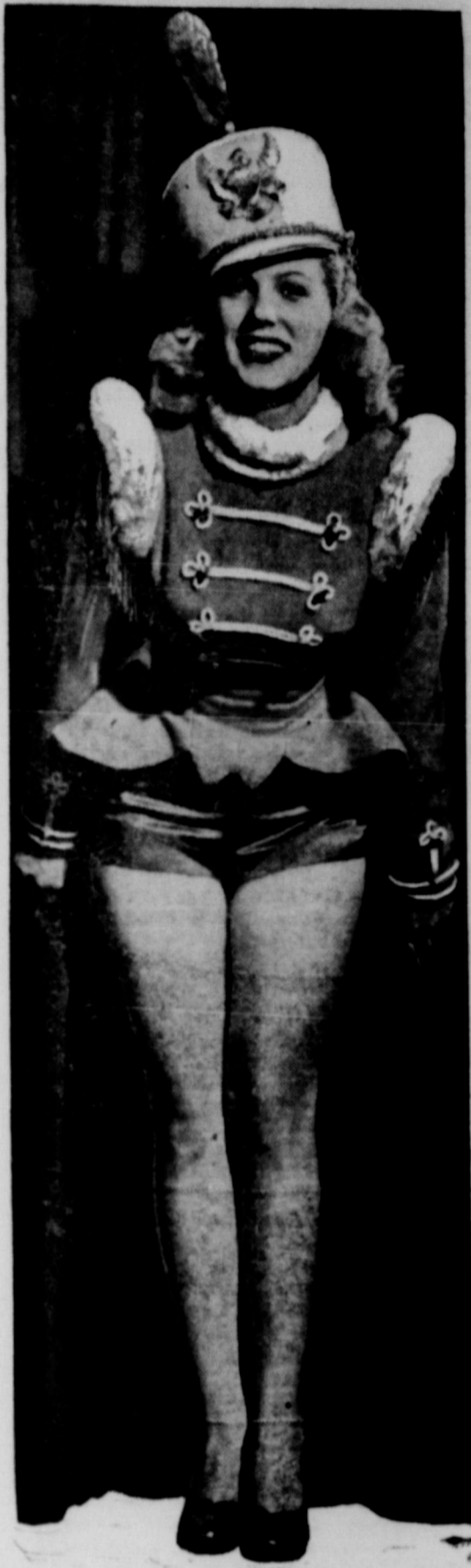
We figured you'd stop and look at this picture—then read this small print, too, and that's why it's here. Now be a good sport and read and heed the big type below. THANKS!