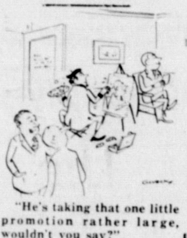
"He's taking that one little promotion rather large, wouldn't you say?"