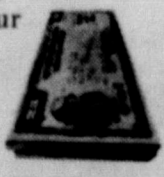
If they're not stolen, or destroyed, we replace 'em.

Take stock in America Buy U.S. Savings Bonds