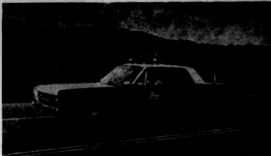
MODERN PATROL CARS of the Texas Department of Public Safety will be cruising Texas highways in full force over the long July 4th weekend. Trained and experienced officers of the DPS will render assistance, promote a safe and smooth flow of traffic and enforce the law.

A new decorative note has been added to desk design. Textured vinyl-clad steel, in a variety of attractive colors, is used on drawer fronts and back panels of H-O-N's new desk line. The vinyl highlights the appearance of the desk and provides added durability and long wearing qualities. Free from paint chipping problems, H-O-N desks and credenzas are available in hundreds of optional arrangements.