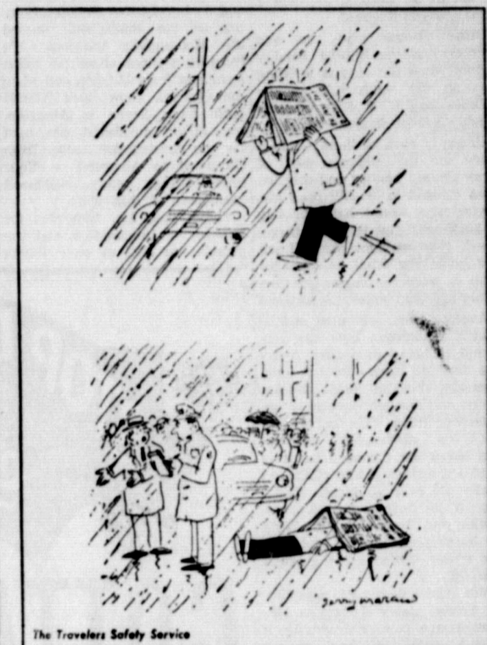
Careless walking is the cause of a high percentage of pedestrian casualties.