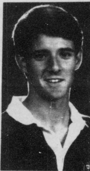
committee to have the strongest abilities and accomplishments and the greatest potential for success in rigorous college studies.