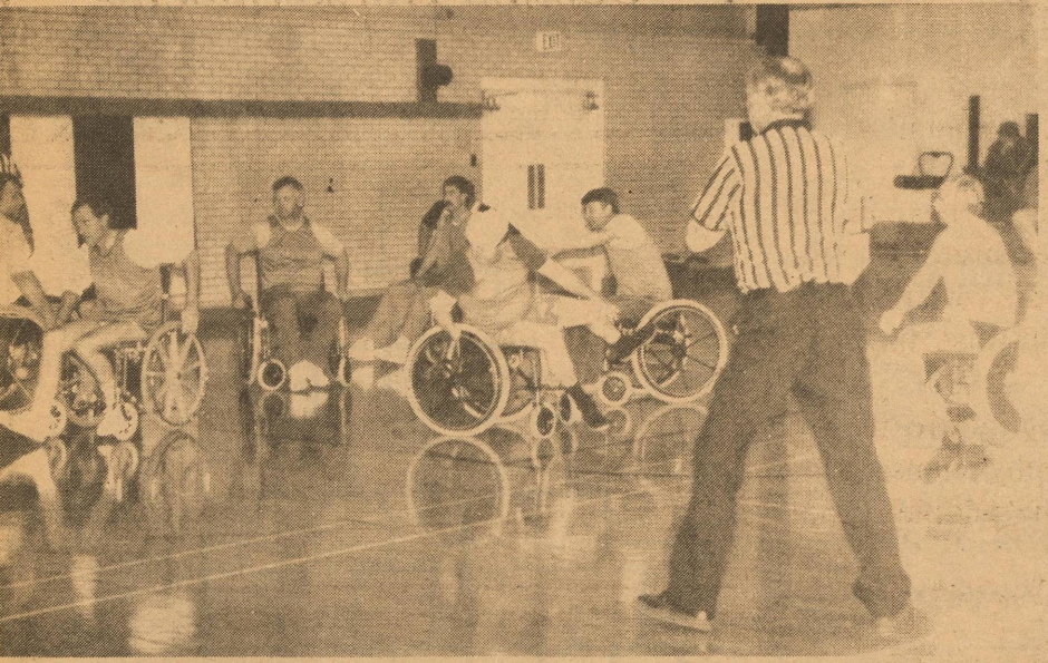
Members of the Eldorado Lions Club battle hard during last weeks basketball game against Shannon Rehab.

When snowy owls fly south for the winter, they head for places that remind them of the empty open tundra back home. Apparently, a big-city airport fills the bill, because more snowy owls congregate at Boston's Logan airport than any other spot in Massachusetts. According to "International Wildlife" magazine more than 100 of the birds have been identified and tagged since the early 1980s. The airport grounds offer the birds an ample diet of rodents and small birds and the owls provide a valuable service by keeping flocks of birds off the runways.