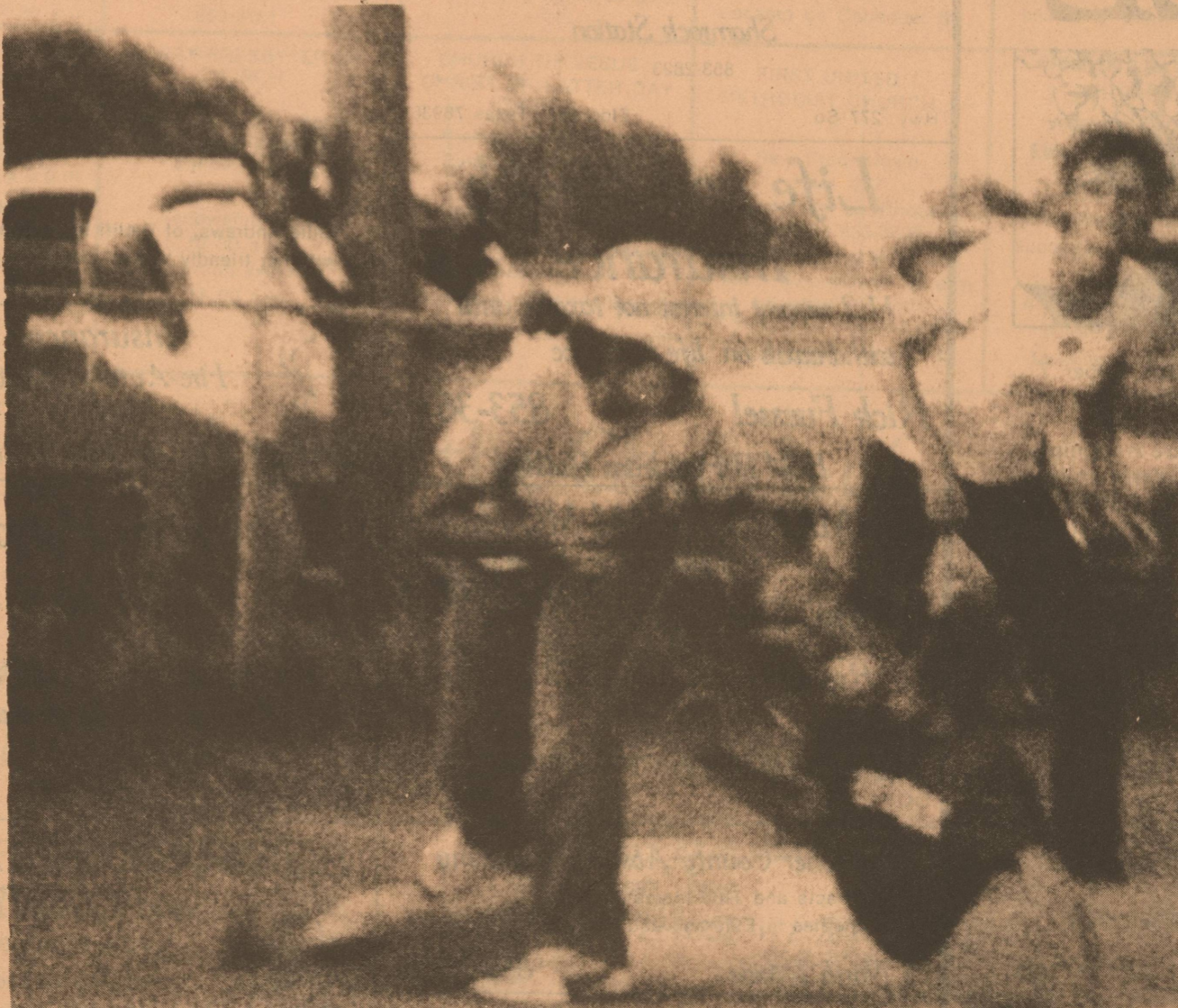
Who says baseball can't be rough? Just ask this Little Leaguer attempting to steal third!