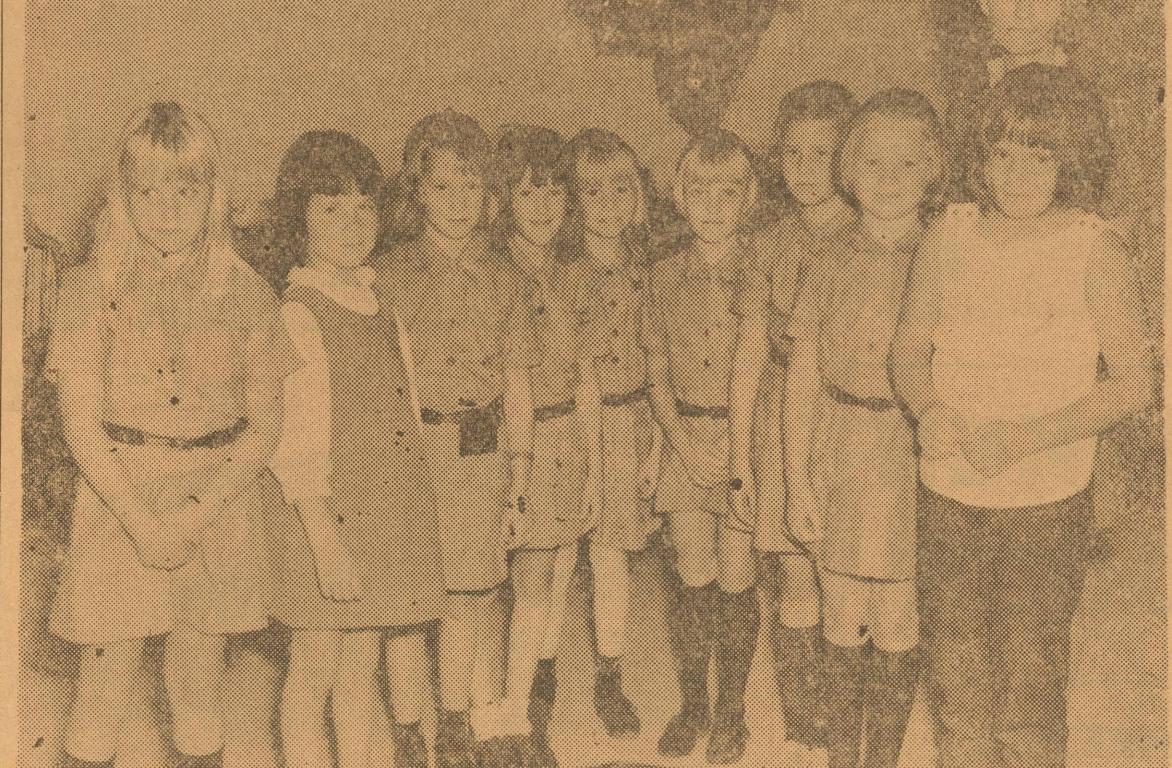
Typical Group of Brownies Who Are Getting Ready for Girl Scout Week