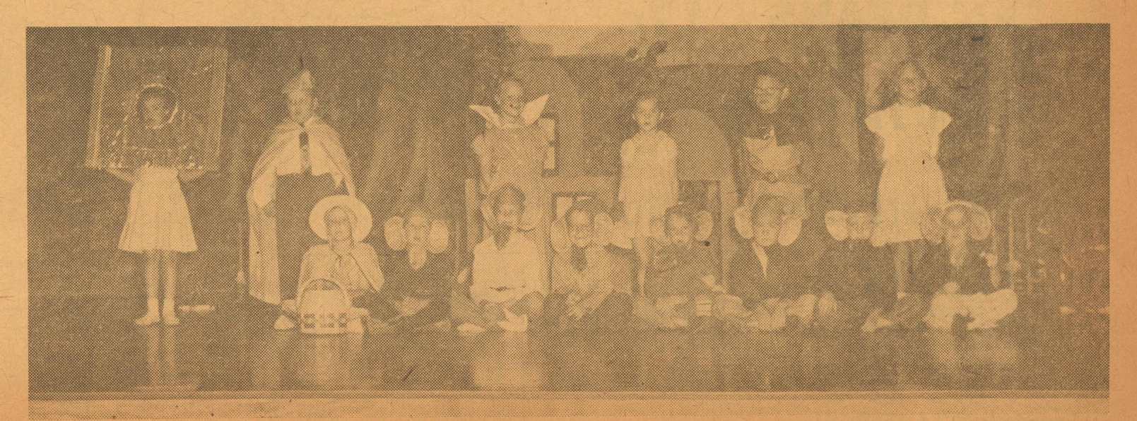
Snow White and the Seven Dwarfs