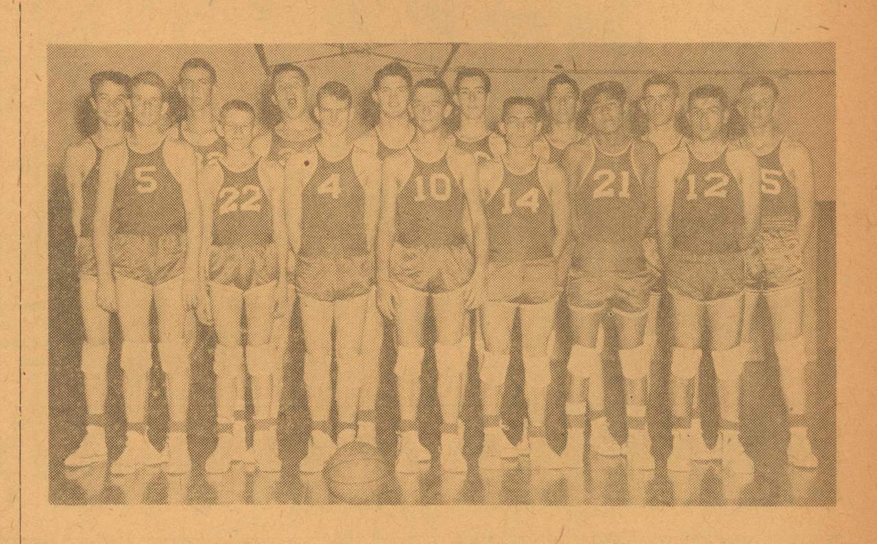
The Eagles Basketball Squad