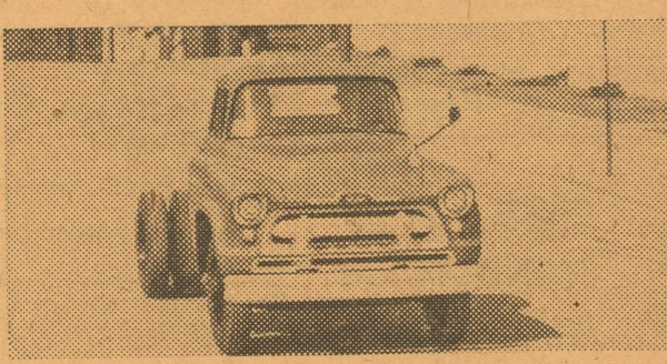
Automatic transmissions like Hydra-Matic* and revolutionary new Powermatict.