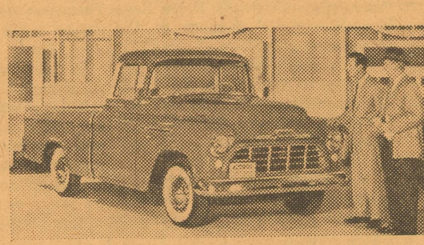
Advanced Work Styling-modern truck beauty that's good advertising for your business.

You'll find them all-and lots more besides-right here, at your Chevrolet dealer's! So take a moment to look them over. Then come in and talk over your truck needs.