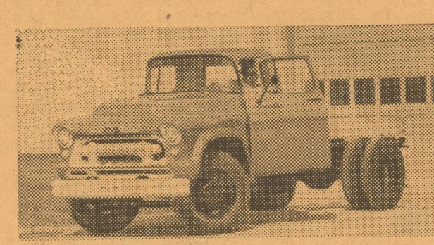
Ball-Gear steering that cuts friction and makes your job easier at every turn!

Modern features such as those shown above are