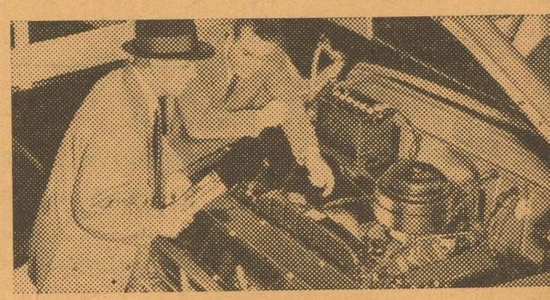
Modern short-stroke V8's, which are either standard or optional at extra cost in every model.

*An extra-cost option in 3000 and 4000 series trucks. †Optional at extra cost in 5000-10000 series models.