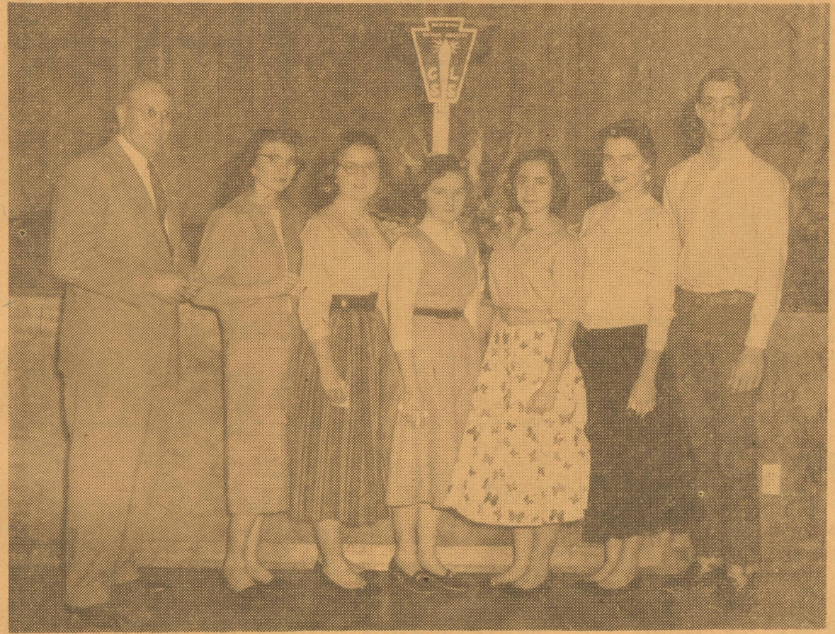
National Honor Society