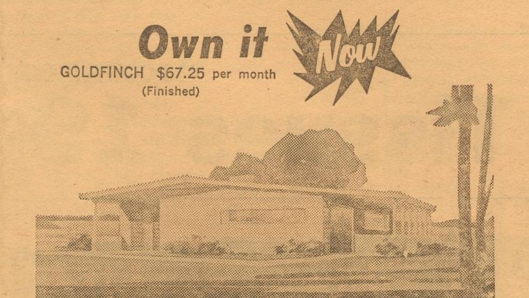
No Money Down—Up To 15 Years To Pay

The Goldfinch is just one of the Reliance homes Investigate the complete line at