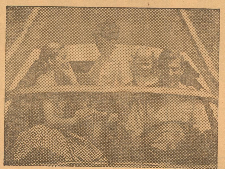
THEY ALL GO TOGETHERprompt action, low borrowing cost, convenient terms of repayment-