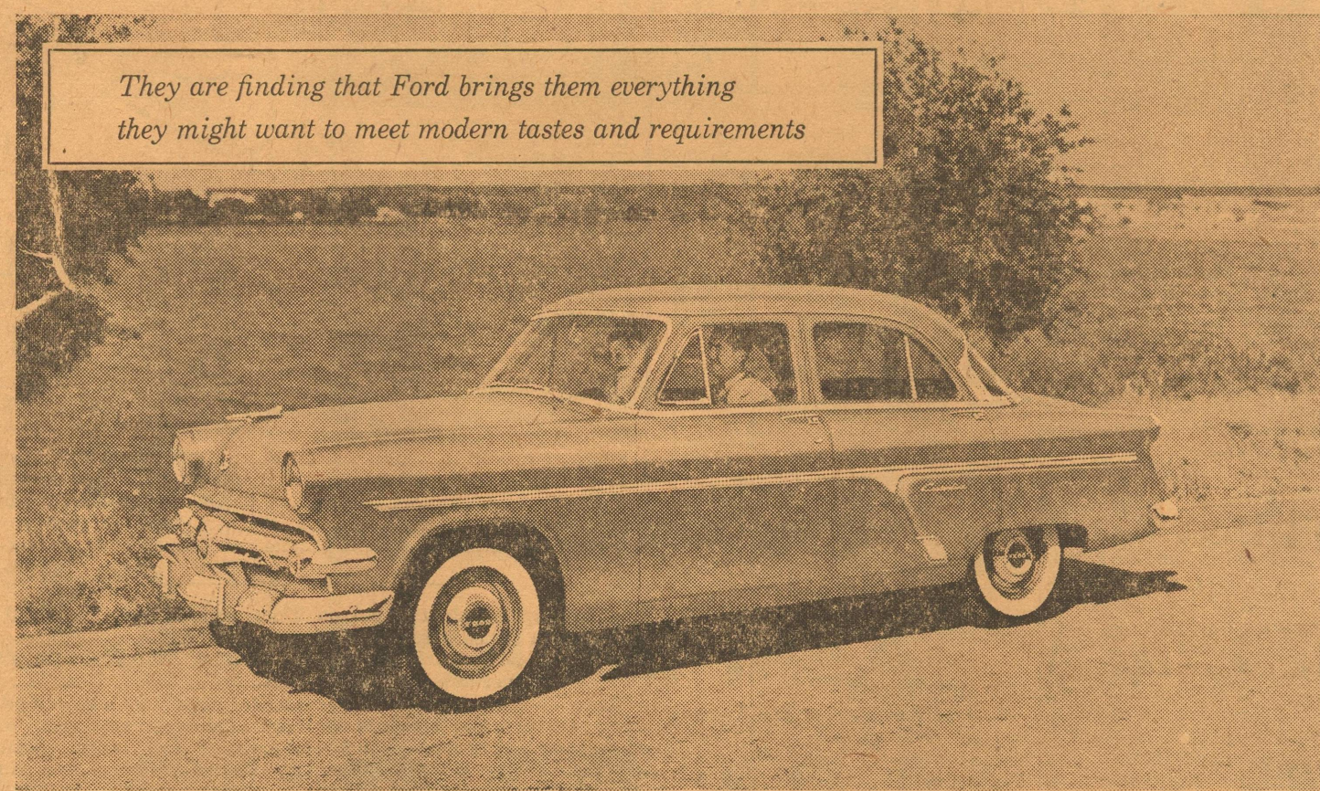
You can't buy better! It's the stunning Customline Fordor Sedan.