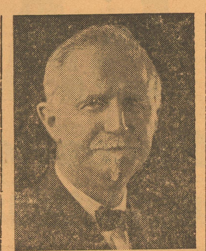
Roger W. Babson

the first half of 1954. Both the the estimated repairs to the resi-Abilene. automobile stocks and the cars dence to put it in its original conwill be in less demand. There will dition would cost $10,000.