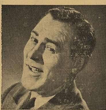
"But I felt better after my Gulf man told me he'd help me keep my present car rolling, if I'd let him give it the Gulfpride* and Gulflex** treatment regularly."