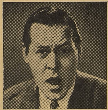
"It hit me hard when I found out that I may have to wait 2 or 3 years past V-Day for a new car. My old car's gotta