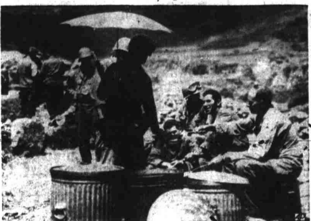
DINING IN STYLE—A U. S. 25th Division infantryman daintily shields himself from the hot Korean sun as his mess kit is filled during a lull in the battle near Masan on the southern front. (U. S. Army Photo via AP Wirephoto).