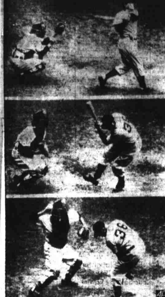
MIZE VERSION OF RUTHIAN SWING—Here is how Big John Mize, Yankee first baseman, looked as he struck out on a 3-2 pitch as he tried for his fourth consecutive home run in the eighth inning of the Detroit-New York game at Detroit, Michigan.

For the Broncs it was their third successive time to eliminate a playoff foe without surrendering a decision, and their 12th successive playoff victory.