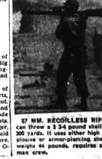
57 MM. RECOILLESS RIFLE can throw a 2 3/4 pound shell 4,300 yards. It uses either high explosive or armor-piercing shells, weighs 44 pounds, requires a 2-man crew.