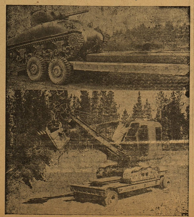
The big heavy-duty flat-bed Fruehauf Trailers which proved of such tremendous value in transporting heavy peace-time machinery are now proving their worth in war-time. The same type of trailers, with considerable equipment installed, are being used to haul fighting tanks to the front and to retrieve them when damaged by enemy fire