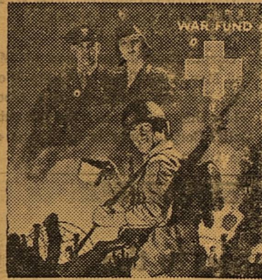
Your RED CROSS is at his side

The meeting will be held Saturday, March 25, in the home demonstration agent's office, and will begin at 10 o'clock a. m.