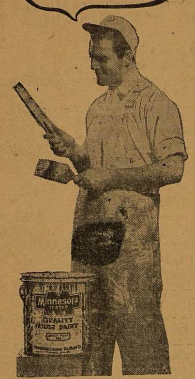
PRESERVE & BEAUTIFY YOUR HOME

If you know paint, it's easy to see why more and more people are asking for Minnesota Brand."