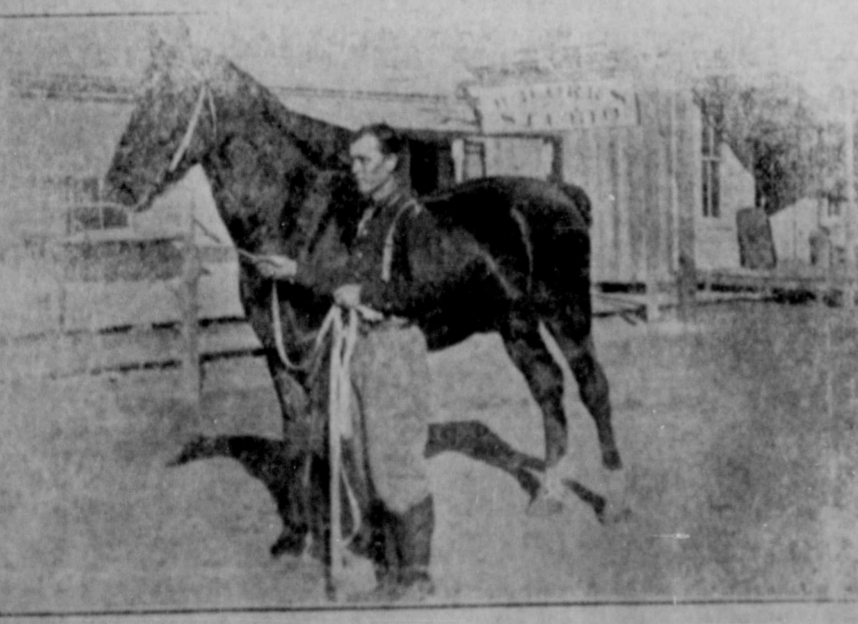
LAKEVIEW HORSE CO.

Will make the Season of 1910 at Lakeview, Hall County, Texas, at the following terms: $10.00 for single leap, $20.00 by Season and $25.00 to insure living colt, also our