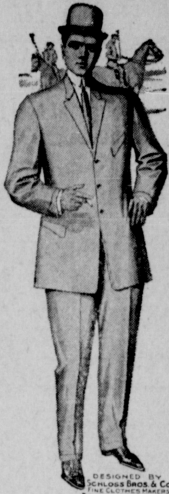
DESIGNED BY SCHLOSS BROS. & CO. THE CLOTHES MAKERS, BALTIMORE & NEW YORK