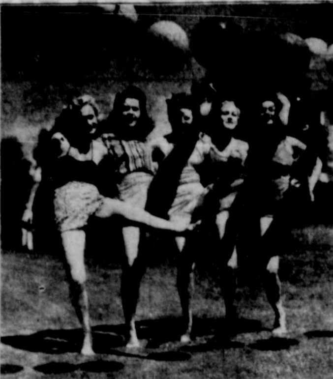
Five beauties from Clifford C. Fischer's 'Folies Bergere of 1941,' one of the leading attractions at the Golden Gate International Exposition...