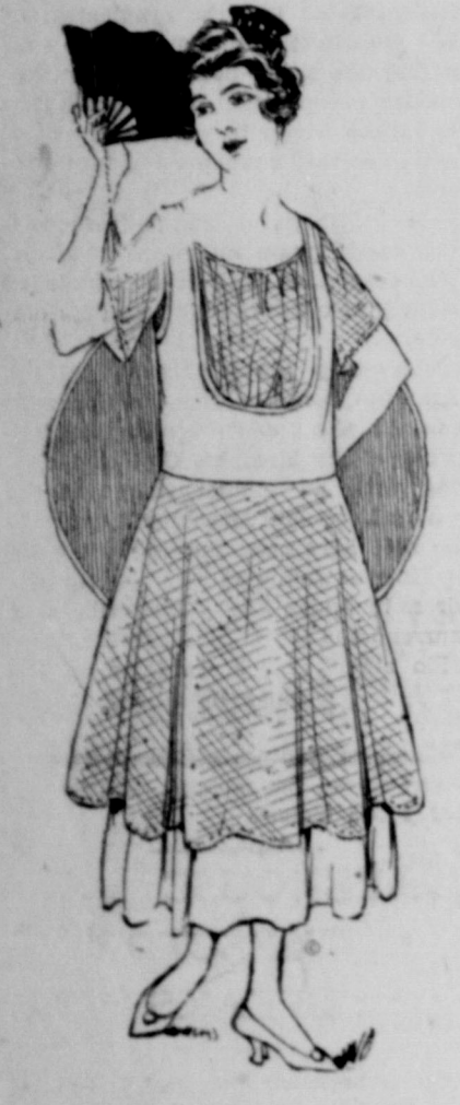
Commencement Frock of Voile

It is no longer considered the proper thing for the graduate to be elaborately dressed in silk or satin; many if any, is permissible; a small brooch of the daintiest frocks are fashioned or a tiny Lavalliere is quite enough. by the graduate herself, from the sheer voiles, organdies, nets, or from the dainty flouncings of lace or embroidery. The high schools favor the idea of the graduate fashioning her own dress; some go as far as to suggest the material and the cut for the entire class. Perhaps this does not