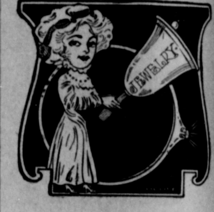
When You Ring the Belle