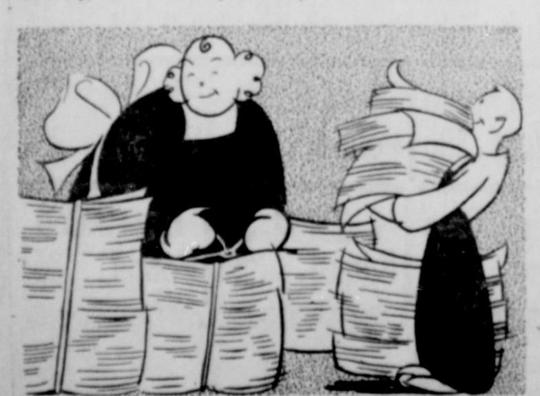
SELL your old newspapers and magazines. Also, old rags and rubber articles. The Salvage for Victory program needs them.

SAVE burlap and cotton bags. They're scarce. Patch them, keep them dry, use them as many times as you can.