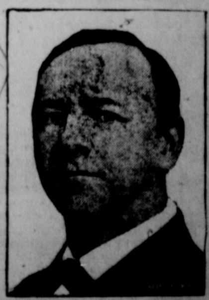
Scorotary of the Navy Day

Reference is made to the necessity for keeping all industries at their highest efficiency and it is declared that "the men and women who devote their thought and energy to these things will be serving their country and conducting the fight for peace and freedom just as truly and just as efficiently as the men on the battlefield or in the frenches."