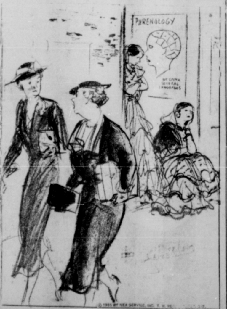
"Those people fascinate me. I'm something of a gypsy, myself."

about when she wasn't shining up the silver and making the beds? She had a young man who worked on boats over at the club, a stolid young German with a forelock which he touched in old-country fashion. Did Gerda's heart go pitty-pat whenever this young man passed by? Zoe wanted to know.