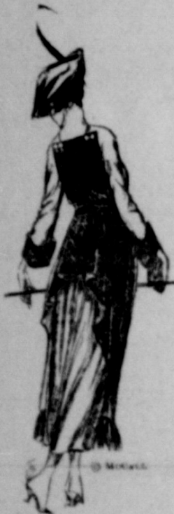
A Phase of the Tunic

The suits and hats and dresses must be made but there is a lack of that little personal feeling that makes the selection and creation of the lingerie just purely delightful. The dainty little touches that