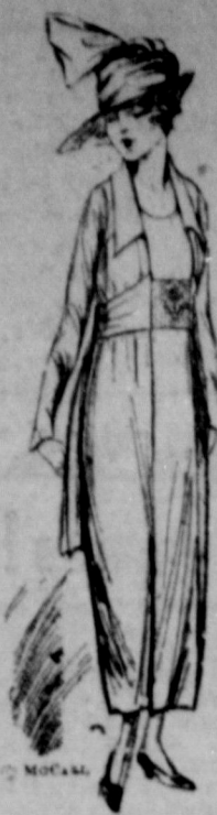
Simple and Smart

The waist and skirt are developed in plain material and the combination is most attractive. The other illustration shows a simple little dress that would be suitable for street wear.