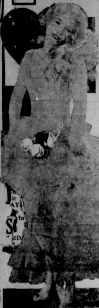
Betty Compson, who will be seen at the Palace tomorrow in the all-talking melodrama, "Woman to Woman."

A "MERIT" Feed for every need. Also bran, shorts, shelled corn, corn chops, threshed maize and hegira, crimped oats, alfalfa hay. Hall County Produce, 1-2 block northeast of Denver depot. 36-3c