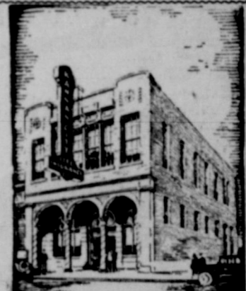
The G. S. Cummings Agency Building, Dallas