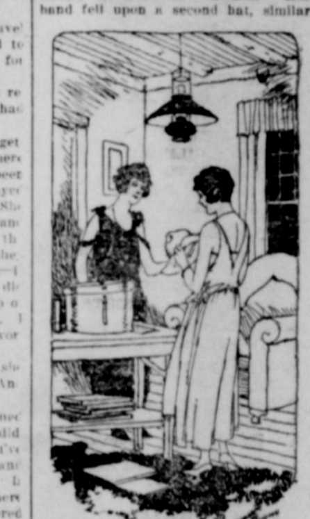
India Picked Up the Hat and Turned It Round Slowly.

ly accepted the American as a relative... "Where's the man among ten thousand?" "Where's the man among ten thousand?"