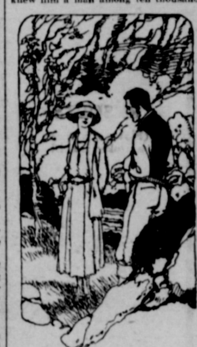
Strong, Clear-Eyed and Masterful, She Knew Him a Man Among Ten Thousand.

"I'm only a workingman, and an... "Where's the man among ten thousand?" "Where's the man among ten thousand?"