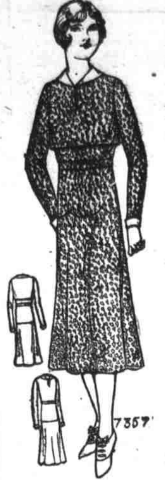
A SMART FROCK FOR THE JUNIOR OR "SUB DEB"

7357. This is an excellent model for youthful and slender figures. As pictured it was developed in printed crepe in a brown and rust pattern, on a white background. Fitted waist portions are joined to a fitted skirt yoke which is lengthened by skirt portions moderately flared and is cut in scallops over the front. A bolero with straight lower edge is the outstanding feature of this style. This bolero may be omitted as shown in the small front view. The sleeve—a one piece model—is finished with a small upturned cuff. A rolled collar outlines a small V neck below which the opening of the dress is effected. Additional opening is made at the underarm seam. Designed in 4 Sizes: 11, 13, 15 and 17 years. Size 13 if made as shown in the large view will require 3 3/4 yards of 35 inch material. Collar and cuffs of contrasting material requires 1-3 yard 35 inches wide. The dress without bolero will require 2 7/8 yards of 35 inch material. The bolero alone with sleeves will require 1 1/2 yard of 35 inch material. Pattern mailed to any address on receipt of 15c in silver or stamps by The Herald. Send 15c in silver or stamps for our UP-TO-DATE BOOK OF FASHIONS, WINTER 1931-1932.