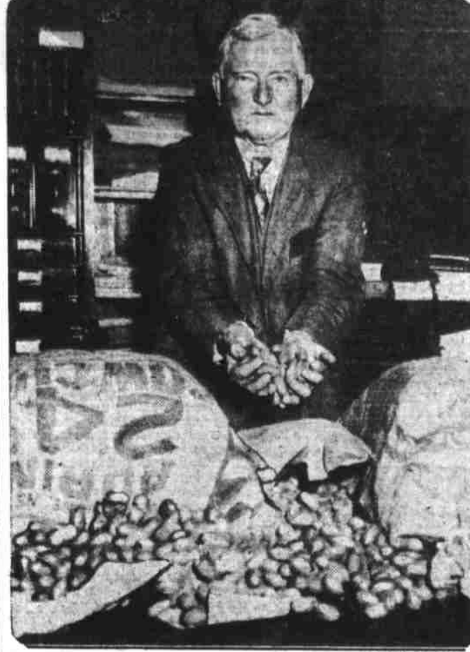
Rep. John N. Garner of Texas, democratic choice for speaker of the house, brought his annual supply of pecans when he returned to Washington. Ordinarily he has a few in his pockets and visitors to his office usually come away with a handful. He raises them on his farm.