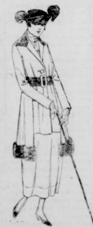
The Straight-Line Silhouette

materials, it can be trimmed with fur, velvet, or left untrimmed, just as it pleases you. The one illustrated here is very simple indeed, the side-panel effect of the coat is one of the newest features of this season. Here the straight silhonette is apparent; the tight sleeves and narrow skirt seem to emphasize it.