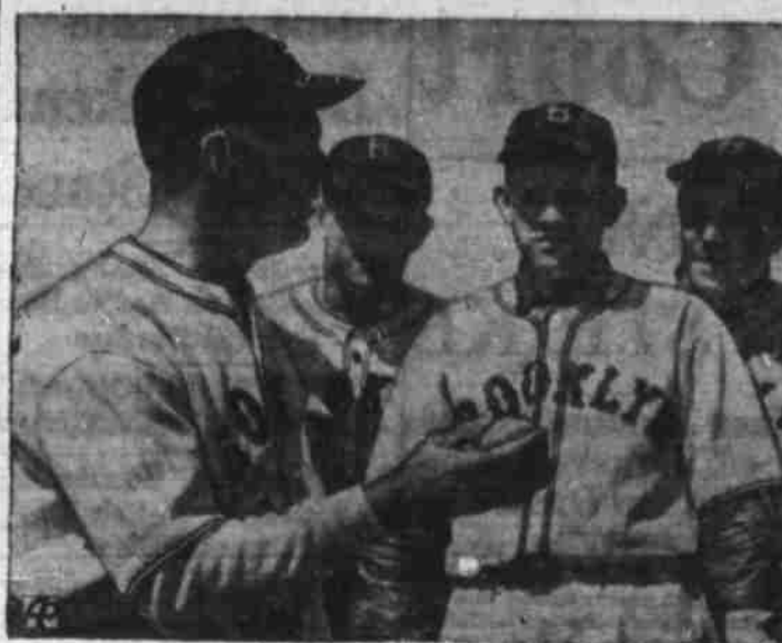
BURLEIGH GRIMES, new boss of the Brooklyn, instructs his pitchers from his own experience as a major-league flinger. He says he'll use his outworn spitball in batting practice—if the Dodgers can hit that, they're good!