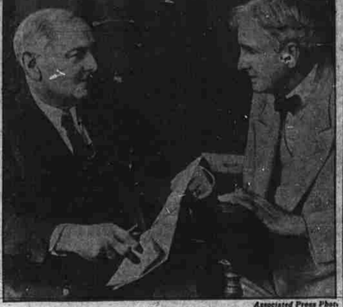
Harry M. Daugherty (left), attorney general in President Harding's cabinet, soon will publish a book describing his version of episodes in the Harding administration which resulted in request for his resignation by President Coolidge.

NANKING, Dec. 31 (UP)—Foreign minister Eugene Chen announced the new nationalist government was determined to defend Chinchow despite General Chang Hsueh Liang's retreat.