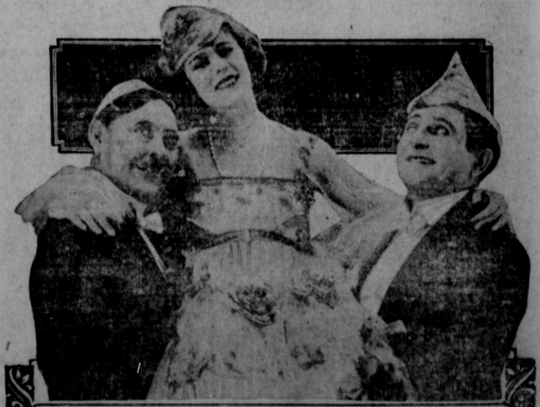
Anita Stewart in "Mind the Paint Girl"

AT THE MAJESTIC THEATRE Admission 10c and 30c