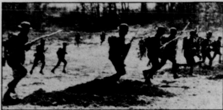
These pictures were not taken by a death-defying cameraman on some foreign battlefield...