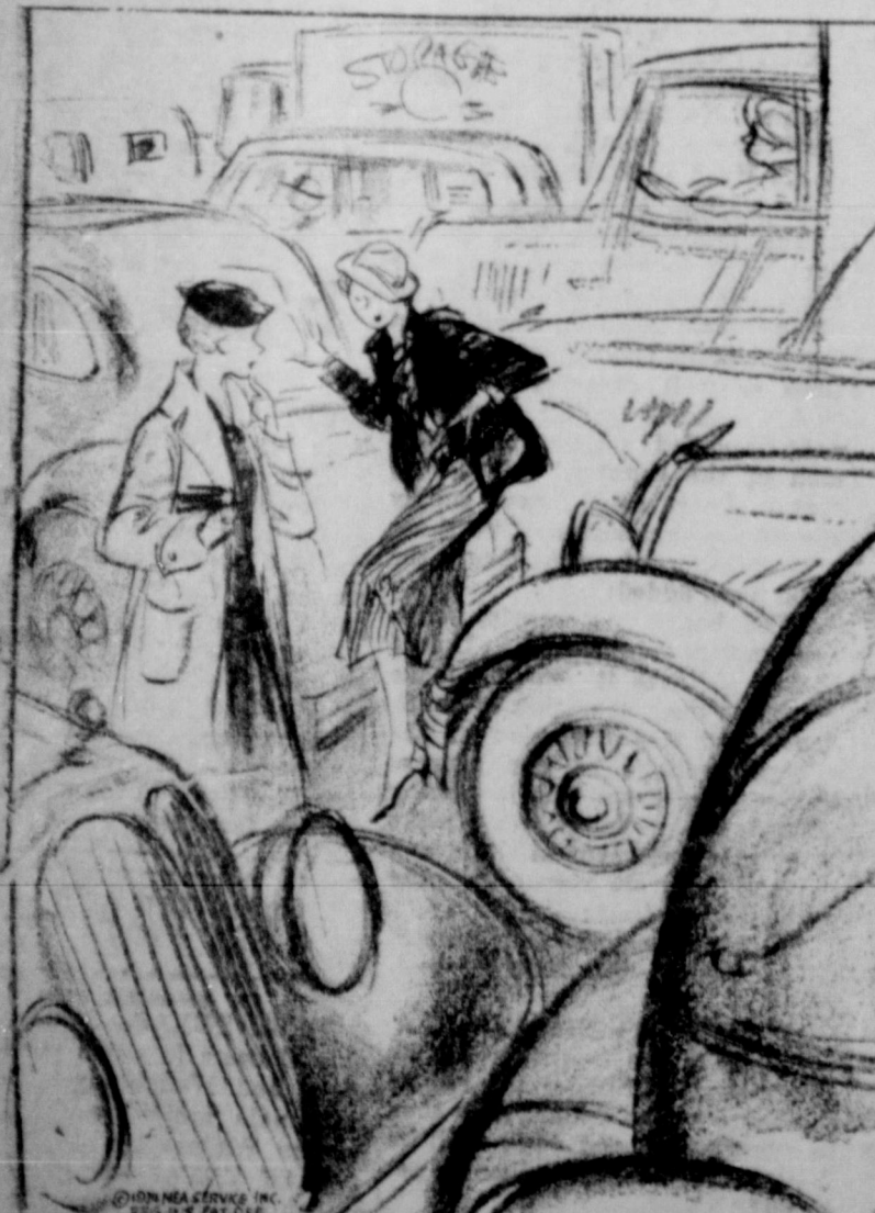
"Now I'm all turned around. Which side of the street did we start from?"