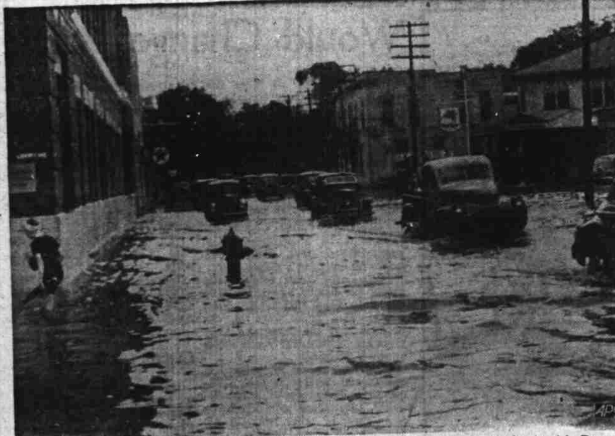
CLOUDBURST FLOODS BEAUMONT — Automobiles plow through the flooded main street in Beaumont, Tex., after a cloudburst dumped a flash flood on the city. At left a pedestrian wades.

WASHINGTON, Nov. 6. (AP)— OPA removed price controls today from household vacuum cleaners and attachments as well as certain items of bedding and home laundry equipment.