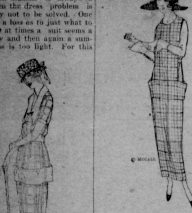
Made of a Colorful Plaid

an exclusive clientele for country suits, and Scotch plaids are in high they will grow faster than ever