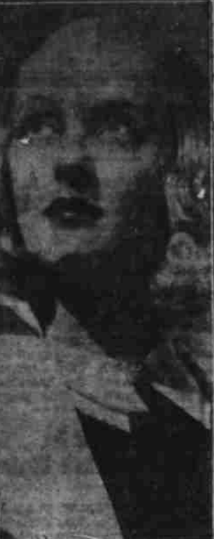
A swarm of protests led to the reopening of the list of candidates for the Academy of Motion Picture Arts award...