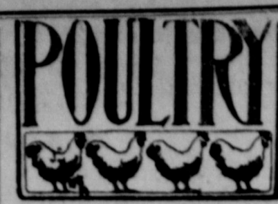
PLAN TO PREVENT MOULTING

written and lectures given and risks "But if was a shame about that pole not being there! You see, I suppose in all the years and years that had gone before, no one had ever gone far to as to put a pole where the North