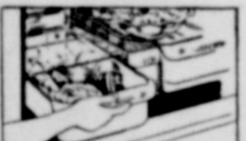
Dew-Action Freshener keeps vegetables and fruit moist and full of flavor.