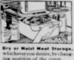
Dry or Moist Meat Storage, whichever you desire, by changing position of the cover.

PLUS... Adjustable Interior Arrangement, 3-Position Sliding Shelf, Trigger Release for Trays, Flexible Metal Ice Cube Release.