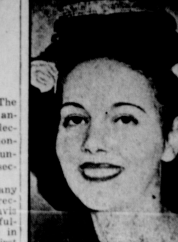
Where there's sport, there must be a queen, and ice hockey is no exception.