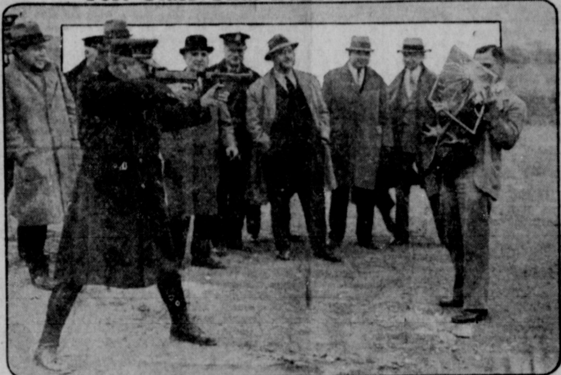
Members of the Philadelphia police department are shown testing the new glass to be used in armored cars. How'd you like to be the detective holding the target? The bullets cracked the glass and made little holes but did not penetrate.