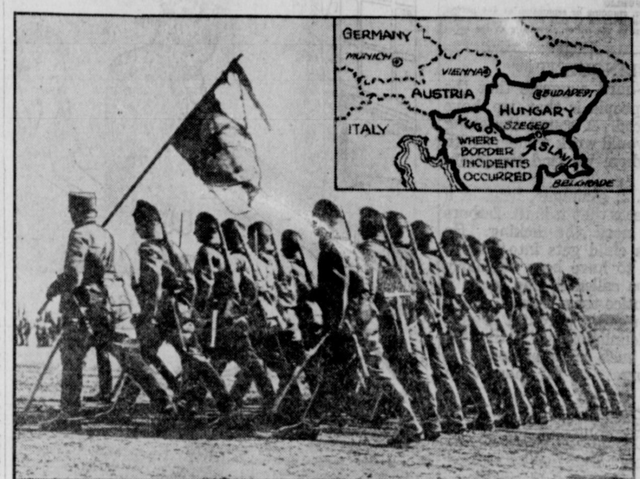
prides. Yugo-Slavia has brought near the Hungarian border troops like those shown above. Serbian infantrymen of the Yugo-Slavian army, proudly carrying their tattered World War battle flags. The map shows the Hungarian-Yugo-Slavian border with the town of Szeged, where irregular Serb troops