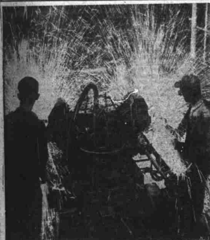
Outlined against a curtain of white-hot sparks, the workmen pictured in this photograph in the Ford assembly plant at Dallas are engaged in electric butt welding, an operation in manufacture of the Ford V-8 which thrills visitors, who, from elevated walks constructed especially for them, may see the manufacturing and assembly processes, either before or after visiting the Ford Exposition building.