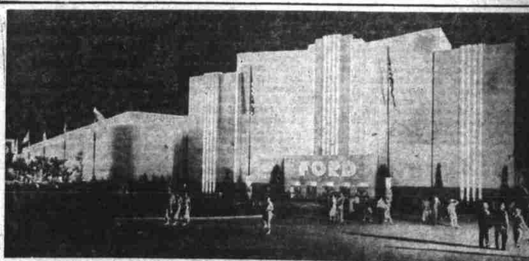
Its solid white walls flooded with many lights, the huge Ford Exposition building at the Texas Centennial in Dallas makes an attractive and imposing structure at night. Parapet lighting adds beauty to the design. The front of the building, which faces Federal Concourse, has rows of Neon tubing which contribute much to the general lighting arrangements.