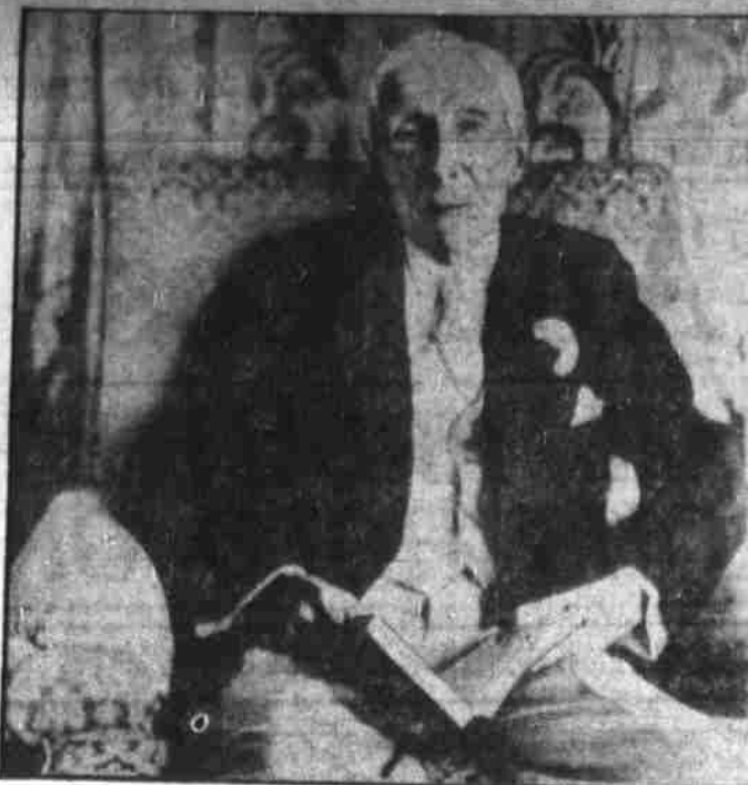
This posed picture of John D. Rockefeller was made at his home, Goll House, New Jersey, two days before he celebrated his 97th birthday in extreme quietude. It was released for publication on his birthday. He expressed confidence he would live to be 100 years old.