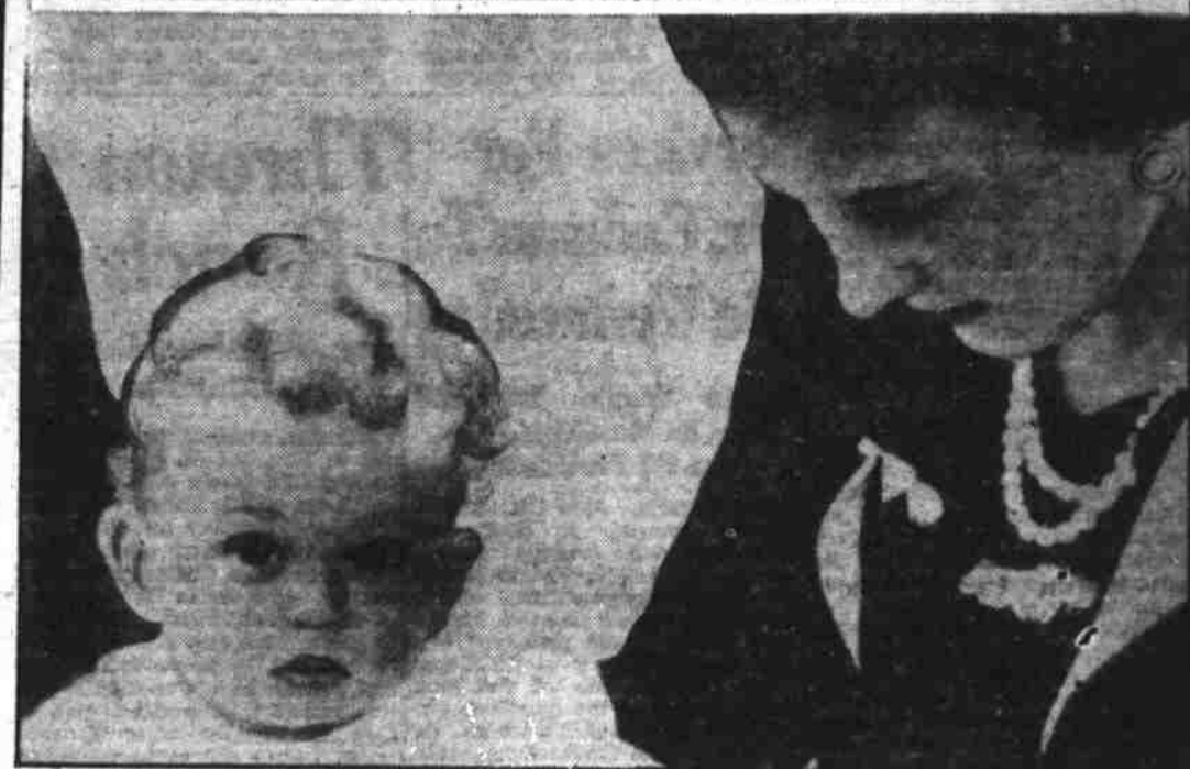
These exclusive pictures from London show young Prince Edward, latest member of the royal family of England, playing with his mother and father, the Duke and Duchess of Kent. The child has seldom been photographed.