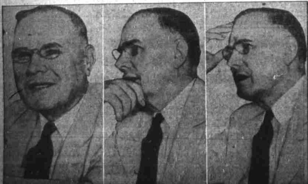
These intimate candid camera pictures give a close-up of William Green, president of the American Federation of Labor at a council meeting in Washington. Left, he registers amusement; center, speculative interest; right, concentration—"how let's see."