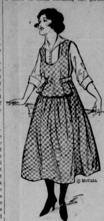
Misses' Jumper Dress

dainty party frocks of flouncings and embroidered batistes, and even nets and taffetas, for Fashion now decrees that taffeta and the flowered summer silks are not too grown-up for small people. One especially pretty little frock of taffeta and net shown in a shop devoted almost entirely to children's thing is trimmed with daisies. a band of them forming the girdle,